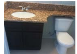
30 inch Counter Height