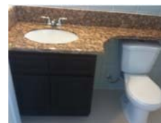
30 inch Counter Height