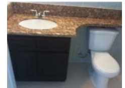
30 inch Counter Height